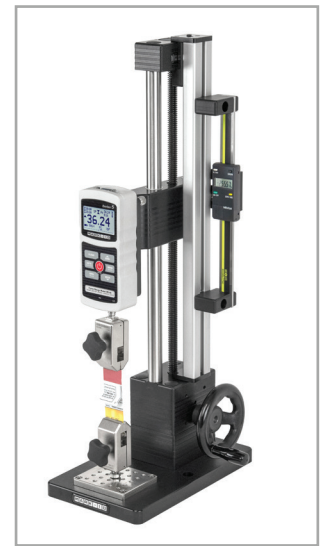
▲ Shown with an ES03 test stand and G1008 film & paper grips

On-board data memory for up to 1,000 readings is included, as are statistical calculations with output to a PC. Integrated set points with indicators and outputs are ideal for pass-fail testing and for triggering external devices such as an alarm, relay, or test stand. The gauges are overload protected to 200% of capacity, and an analog load bar is shown on the display for graphical representation of applied force.